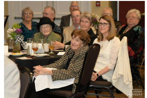
Friends and supporters enjoy the banquet and speakers.

We have a highly skilled and dedicated staff! These people lead and work with our volunteers to reach tens of thousands of people struggling with addiction, those incarcerated, and their families.